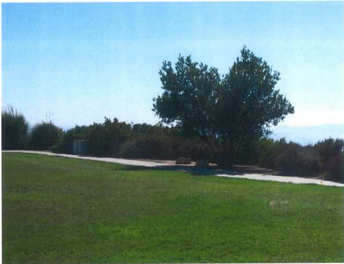
2009: Fitness Station #1