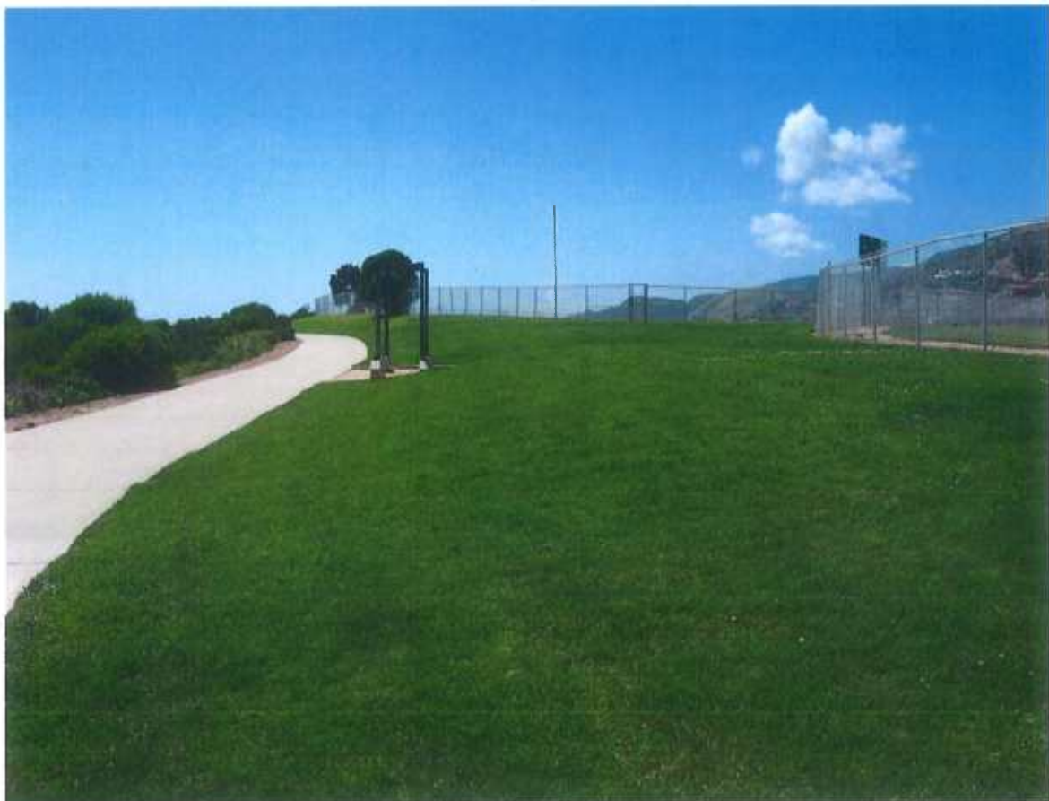
2009: Fitness Station #4