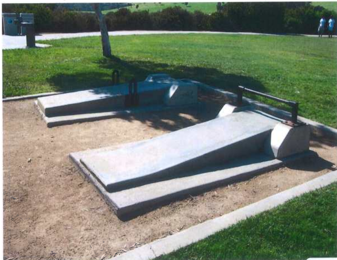
2009: Fitness Station #2