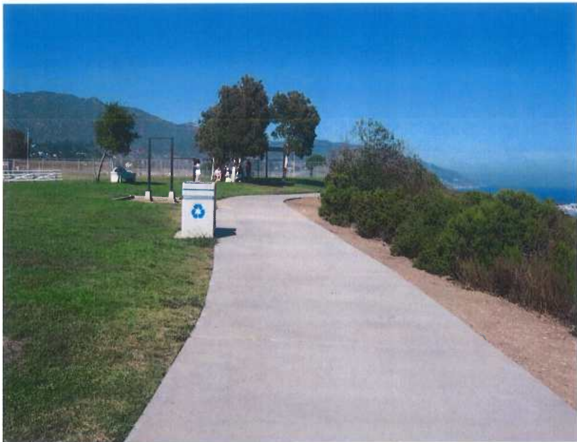
2009: Fitness Station #3